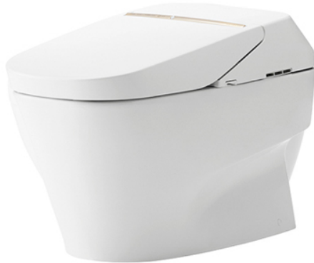
Neorest XH II carrying innovative Actilight Technology