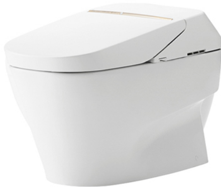
Neorest XH II carrying innovative Actilight Technology