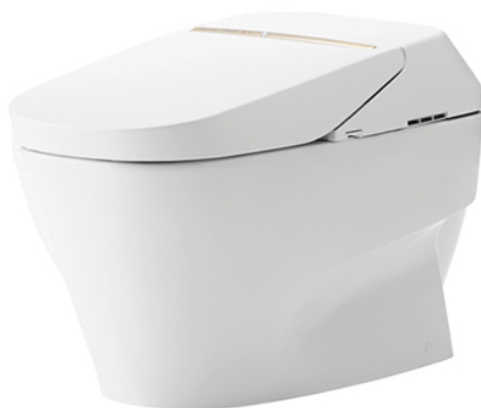
Neorest XH II carrying innovative Actilight Technology