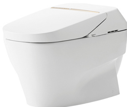
Neorest XH II carrying innovative Actilight Technology