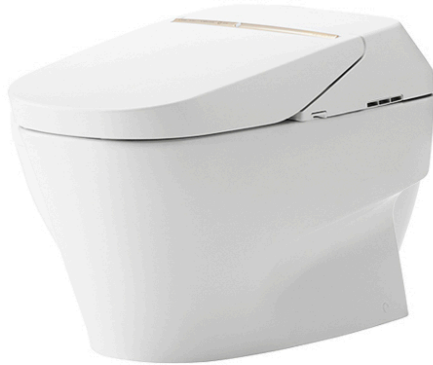
Neorest XH II carrying innovative Actilight Technology