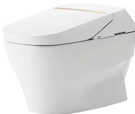
Neorest XH II carrying innovative Actilight Technology