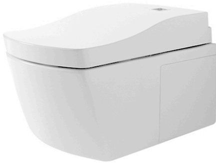
Neorest LE II carrying innovative Actilight Technology