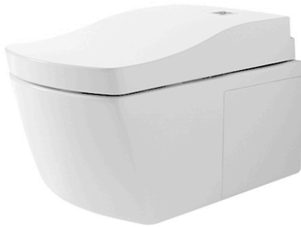
Neorest LE II carrying innovative Actilight Technology