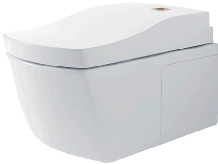
Neorest LE II carrying innovative Actilight Technology